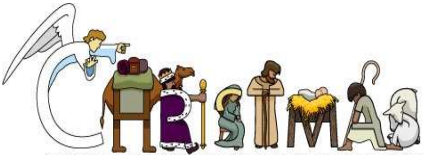
CHRISTMAS IS THE CELEBRATION OF THE BIRTH OF JESUS, THE SAVIOUR OF MANKIND